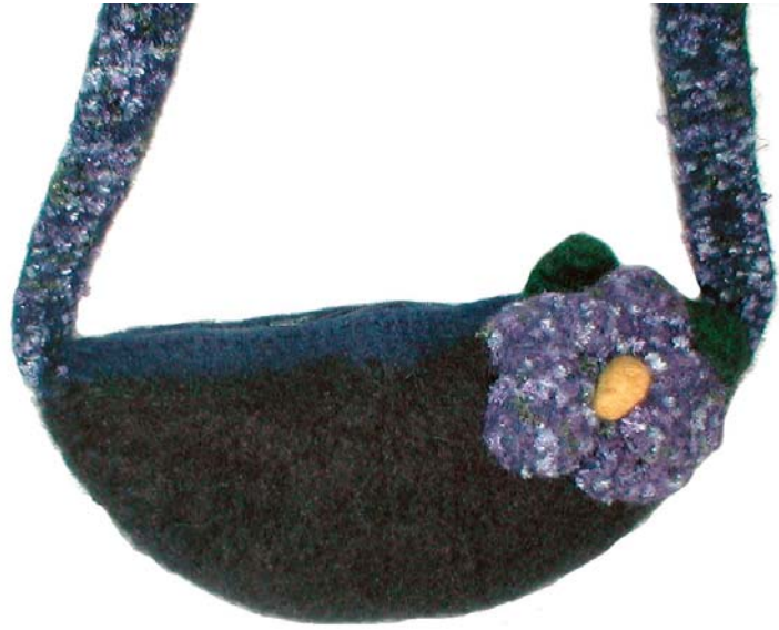
A uniquely shaped felted purse accented with a sparkling violet